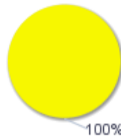
% of MSY NPM VS Applicant VS Not in ANY

■ Applicant:0 ■ National:10.8 ■ Not in ANY:0